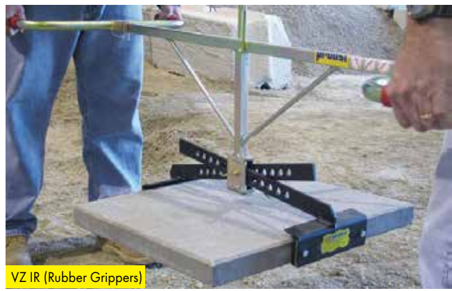
VZ IR (Rubber Grippers)