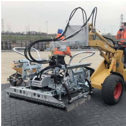
HVZ-UNI-II-EK with HVZ-UNI-II-PK-II