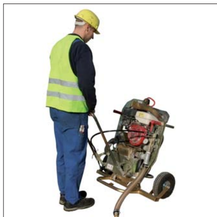
PJ with PJ-RS