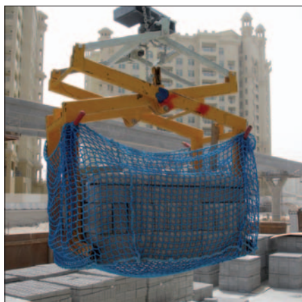
SG – Picture as an example