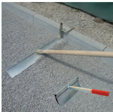
MP-70 + HV-MP