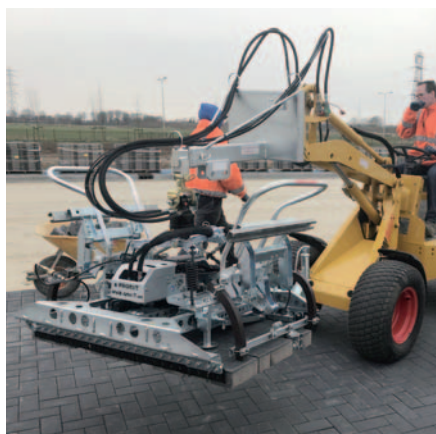
HVZ-UNI-II-EK with HVZ-UNI-II-PK-II