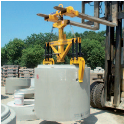
RK + ET