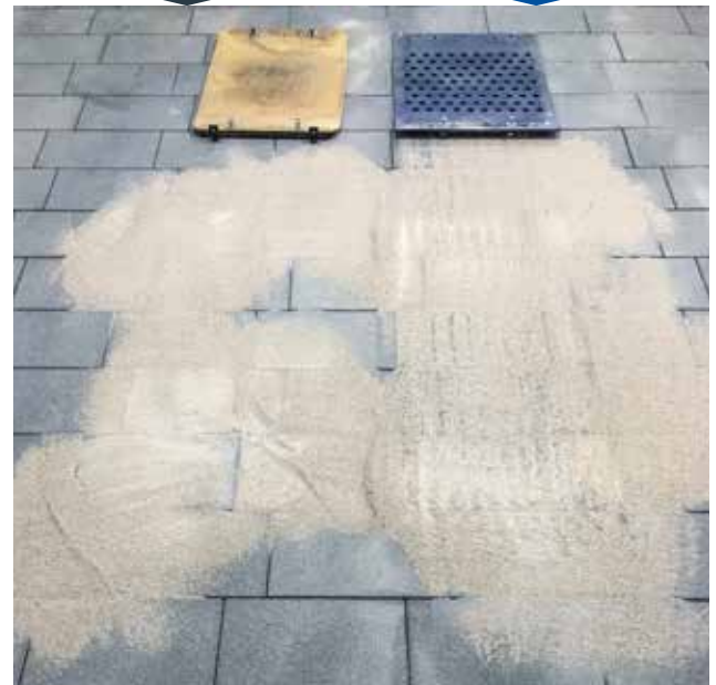
Probst Protective Mat SXR