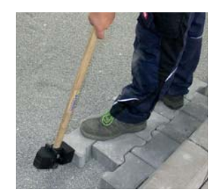
Rubber Hammer GH-ERGO