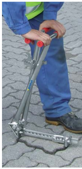
Paver Extractor SZ