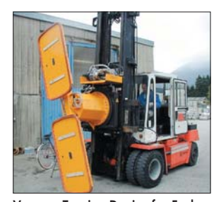
Vacuum Turning Device for Fork Lift Trucks