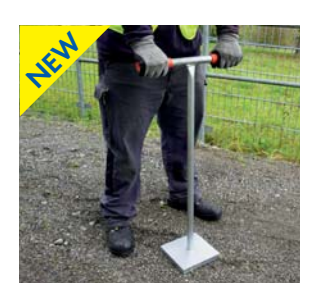
POUNDER PX Soil Compactor