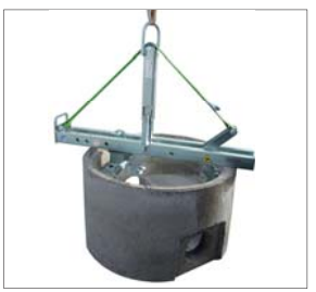
Manhole and Cone Installation Clamp SVZ-ECO