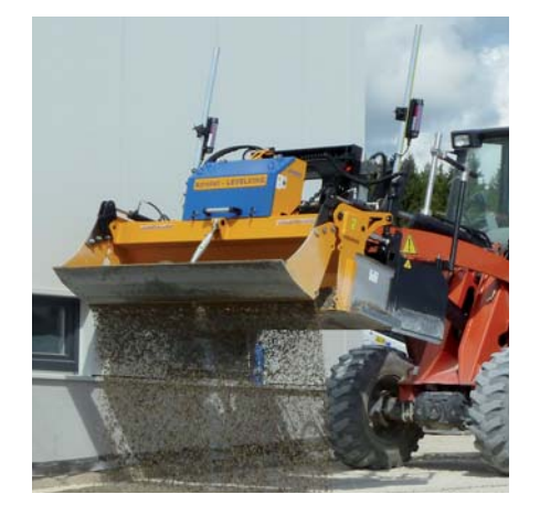
LK-2200 + LK-KS