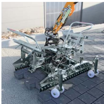
HVZ-UNI-II for VM-X/301/401/203/204