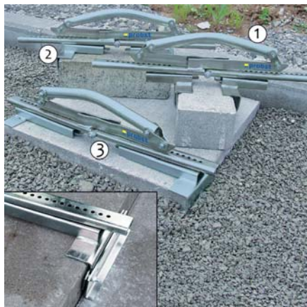
1. PPH-10/37, 2. PPH-22/50, 3. PPH-33/62, bottom: PPH-AA