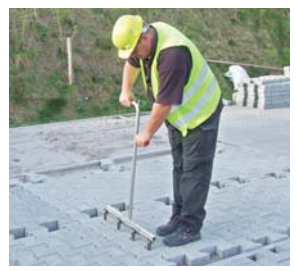
Multiple Alignment Bar MRE