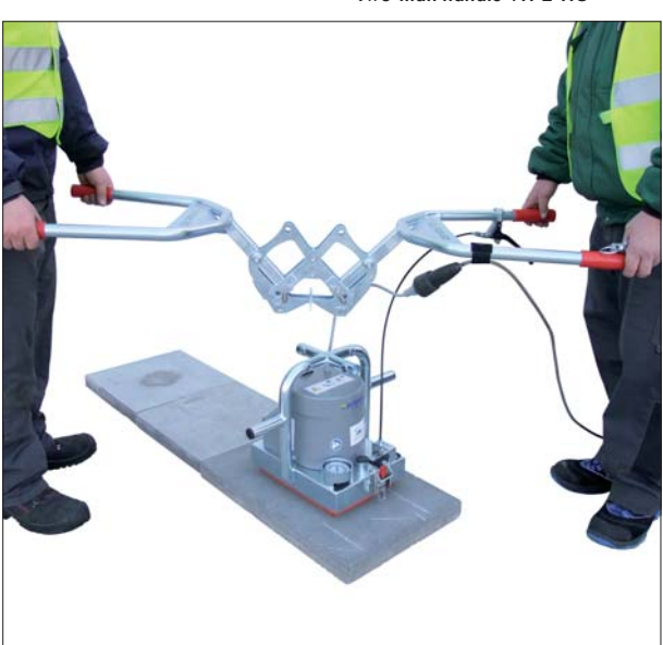
SPEEDY VS-140/200 Vacuum Hand Laying Device