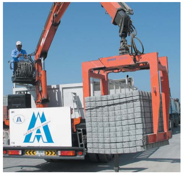
Block Loading Grab AKZ-UNI