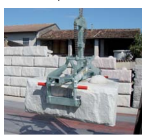
Grab for Prefabricated Concrete Products FTZ-MAXI-25