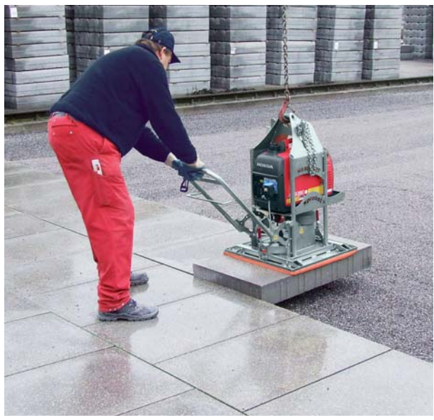
QUICKJET QJ-600-E Vacuum Attachments