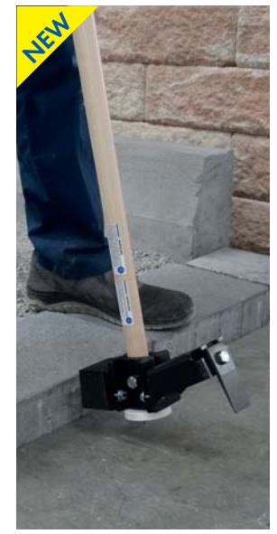
Rubber Hammer-Alignment Bar GH-RE-TWIN