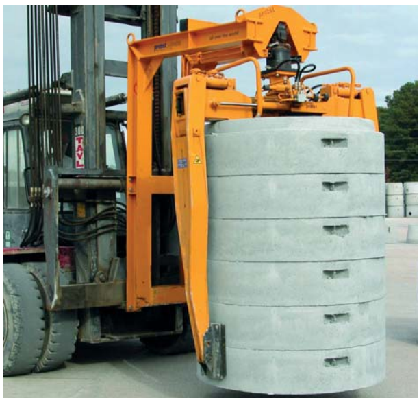
Manhole Ring- and Cone Clamp RKZ-H