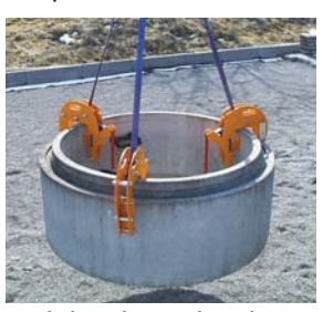
Manhole and Cone Clain Clamp SRG-UNI