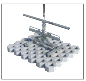
Turf Stone Laying Clamp RGV