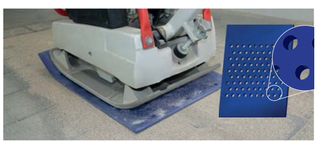
Surface Saver SXR for Vibration Plates