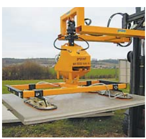
Vacuum Lifting Device SH-1000-MINI with Spreader Bar