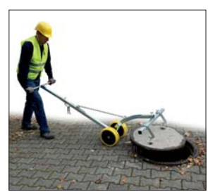
EASYLIFT EL-SDH Manhole Cover Lifter