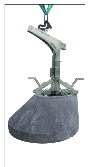
Manhole and Cone Installation Clamp SVZ-UNI-VARIO