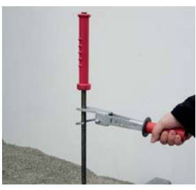
Pin Extractor ENZ-PROTECT