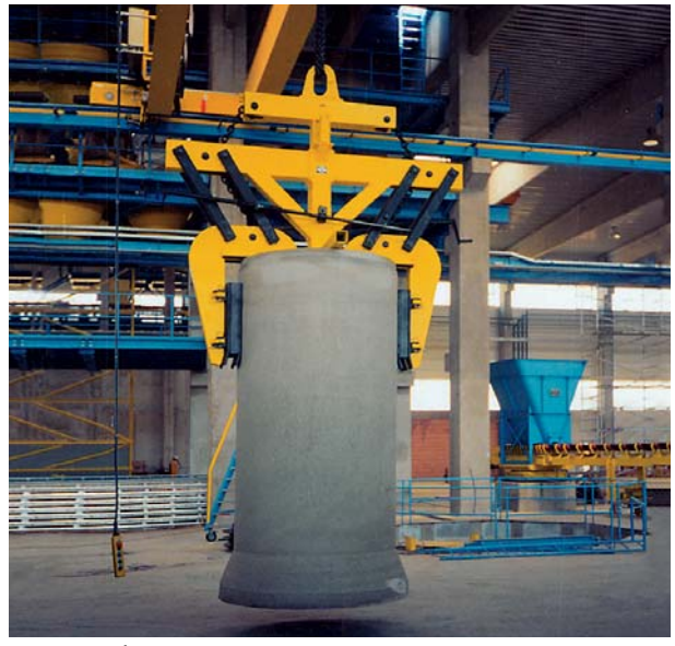
Large Pipe Clamp RK-V