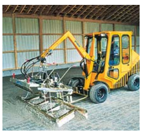
Sweeping Broom EB