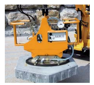
Vacuum Attachments SH-1000-MINI-H