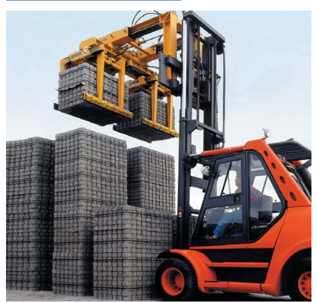
Double Grab with Telescopic Crane Boom STAZ-DZ-II