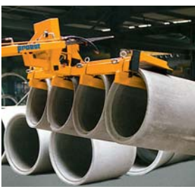
Small Pipe Turning Device FUG