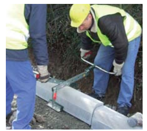
Universal Handles BVZ