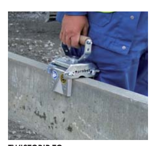
TWISTGRIP TG Kerb and Strip Stone handle