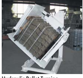
Hydraulic Pallet Turning Device WT-P