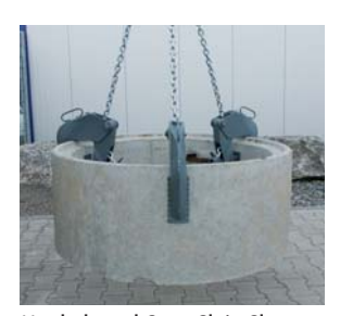
Manhole and Cone Clain Clamp SRG-3