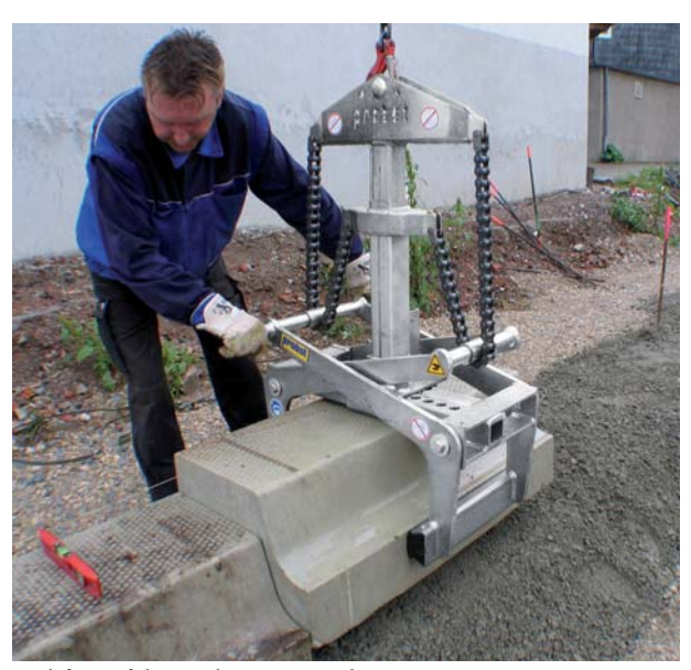
Grab for Prefabricated Concrete Products FTZ-UNI-15