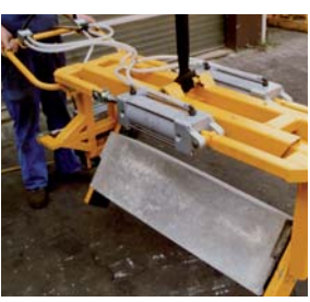
Pneumatical turning grab