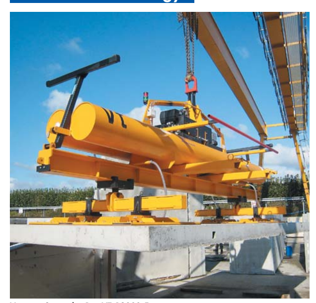
Vacuum Spreader Bar VT-12000-E