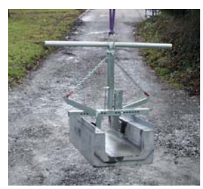
{\bf Hollow\ Block\ Handle\ FSZ-M}