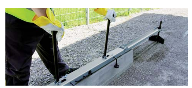
BOBPLAN BP Pulling aid for the concrete subgrade