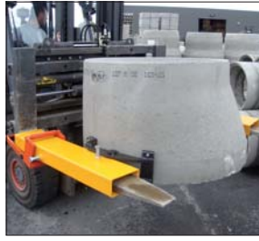
Push-on Jaws ABK for Fork Clamp