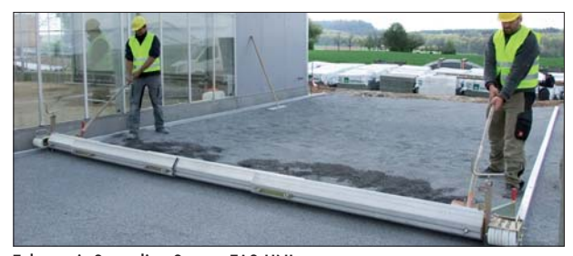
Telescopic Screeding System TAS-UNI