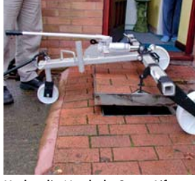
Hydraulic Manhole Cover Lifter SDH-H-15