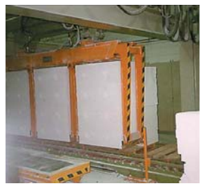
Cube Clamp STAZ with Hydraulic Divider