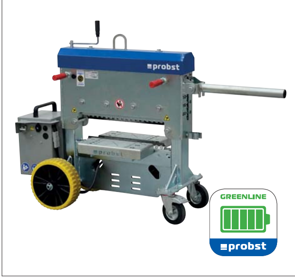
STONE SPLITTER STS-43-EH-23 Electro-hydraulic block splitter