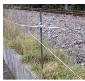
Plump Line Fixture RSH