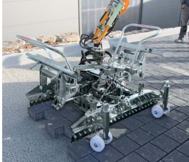
Hydraulic Installation Clamp HVZ-UNI-II