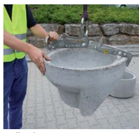
Gully Clamp SAZ-UNI