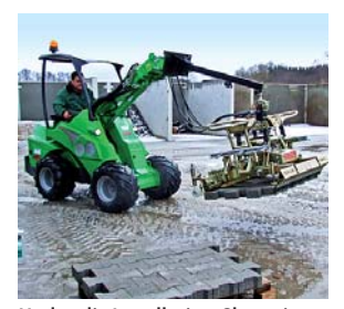
Hydraulic Installation Clamp in combination with Mini-excavator