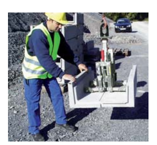
Cable Channel Grab KKV-200