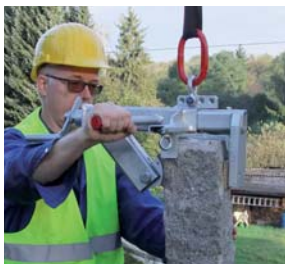
Stone Pillar Grab SLS-8/20-G-VA