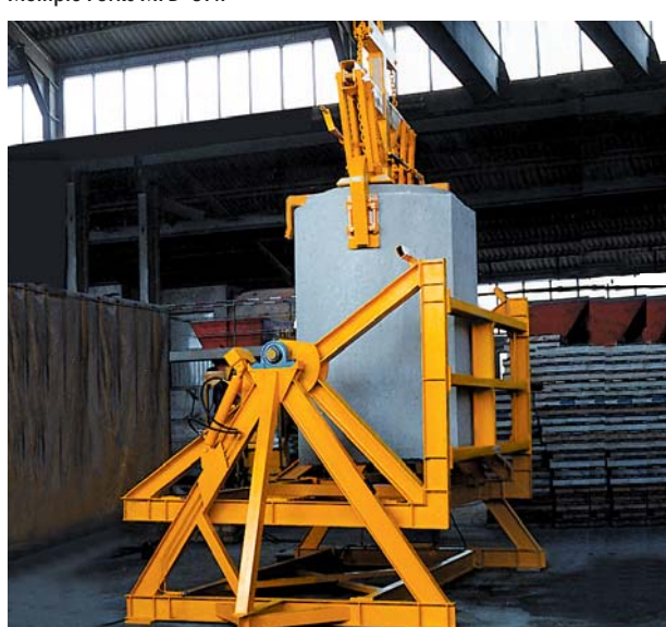
Tilting Table KT-15