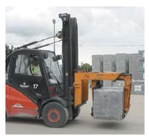
Fork Lift Grab STAZ-KA