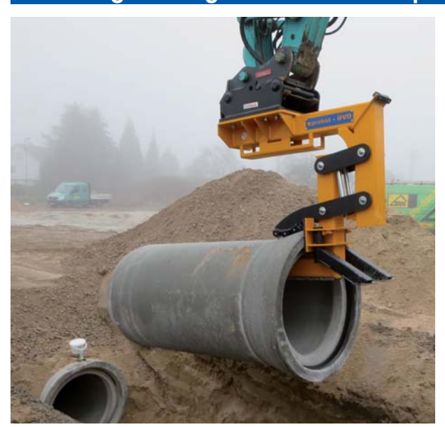
Concrete Pipe Lifter RVD-4,5-ECO