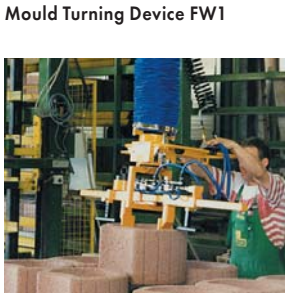
Vacuum Hose Lifter with Pneumatic Clamp ASZ-P