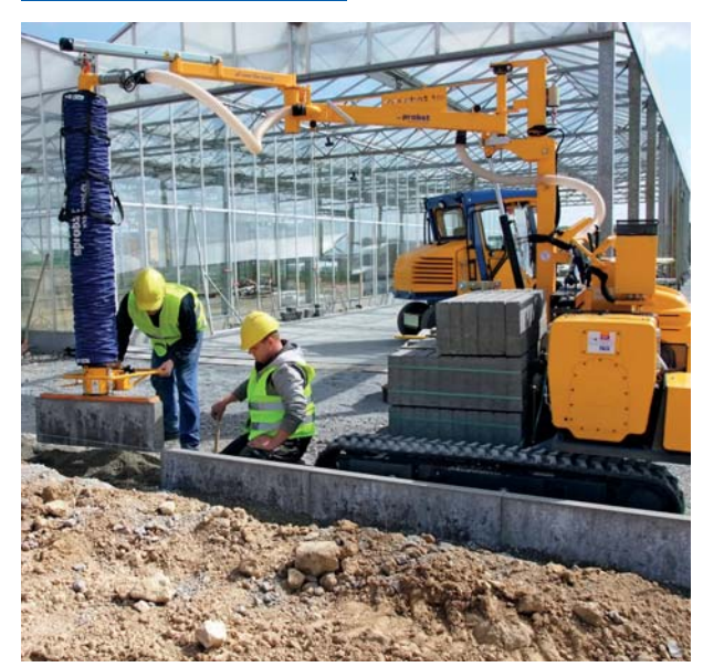
TRANSMOBIL TM Installation Carrier installing kerbs