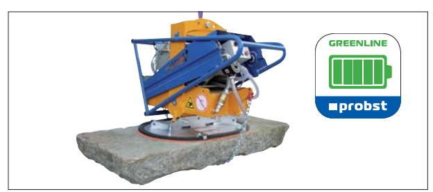
Vacuum Attachments SH-2500-GREENLINE