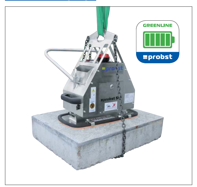
STONEMAGNET SM-600-GREENLINE-POWER Vacuum Attachments