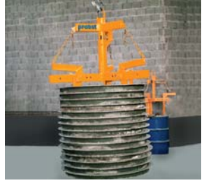
Steel Pallet Grab UMG