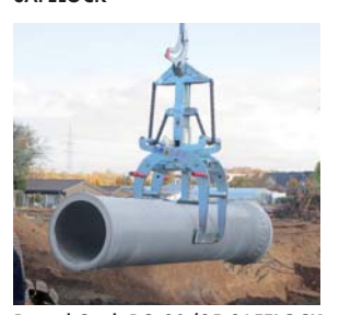
Round Grab RG-20/85-SAFELOCK