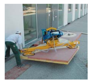
SH-2500-UNI with Spreader Bar