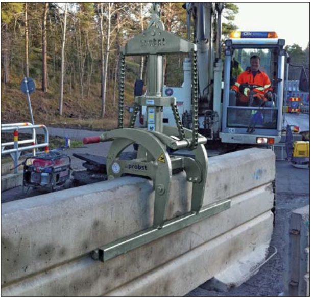
Grab for Prefabricated Concrete Products FTZ-GBA-S