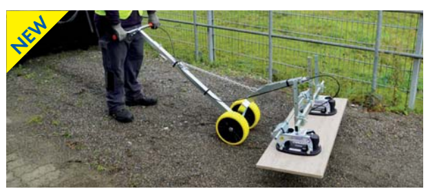
EASYLIFT FXAH-EL-CB with 2 x FXAH-120