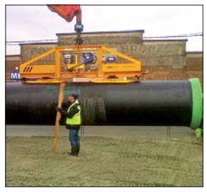
Vacuum Spreader Bar VT for pipes