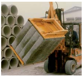
Stack Rotating Clamp WG-P