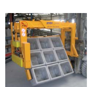
Fork Lift Grab STAZ with 180° rotating grippers