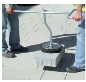
VACUUM-HANDY VH-1/25 with Two-man handle VH-2-HG