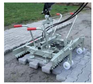
Hydraulic Installation Clamp HVZ-LIGHT