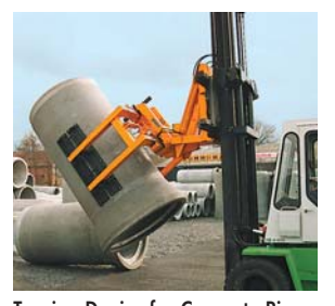
Turning Device for Concrete Pipes