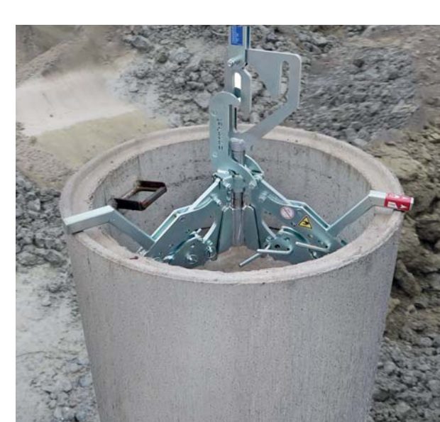
Manhole and Cone Installation Clamp SVZ-UNI