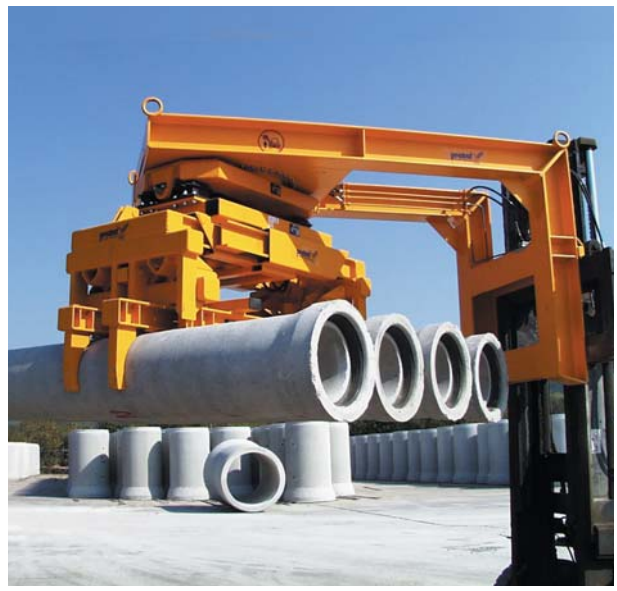
Universal Pipe Grab System URS-ST