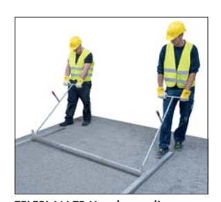
TELEPLAN TP Handscreeding System