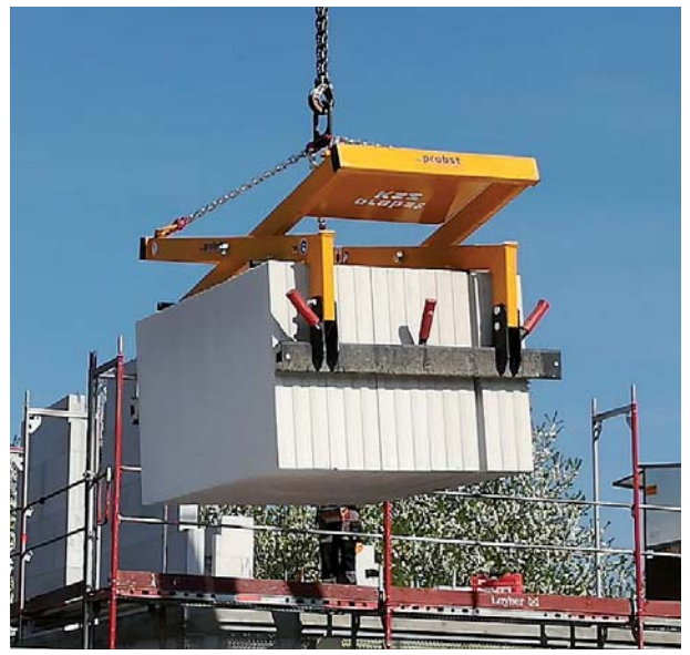
Limestone Clamp KSZ-300-UNI