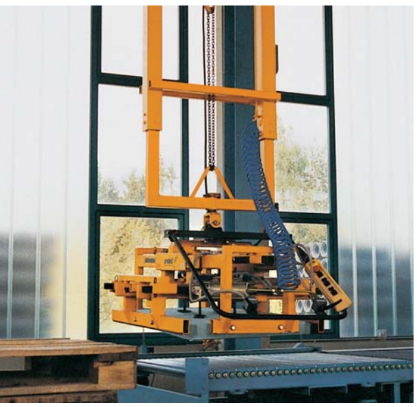
Pneumatic Cubing Clamp ATZ-P+Vertical Guide SRF