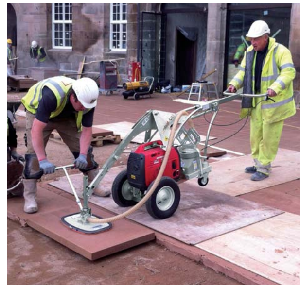
UNIMOBIL UM-VS-S/SE complete version