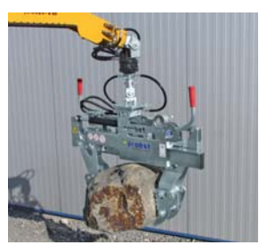
Hydraulic Laying Clamp VZ-H-UNI