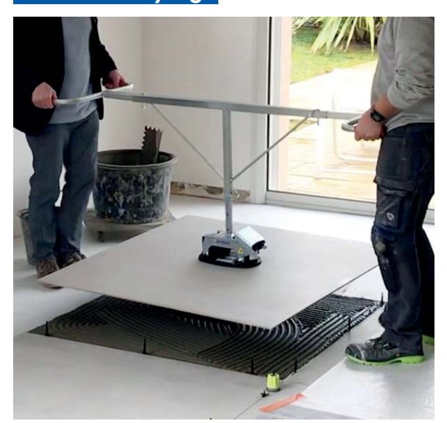
FXAH-120-DUO-Set with FXAH-120