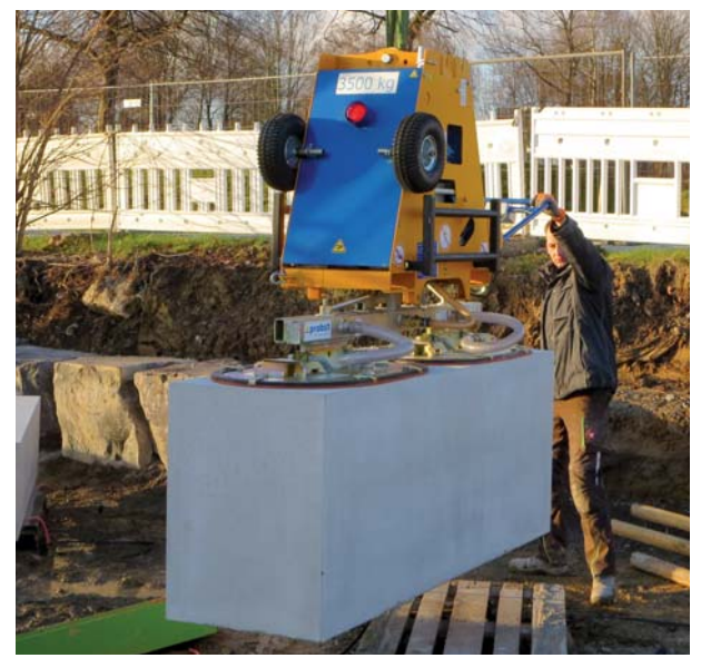
Vacuum Attachments SH-3500-B