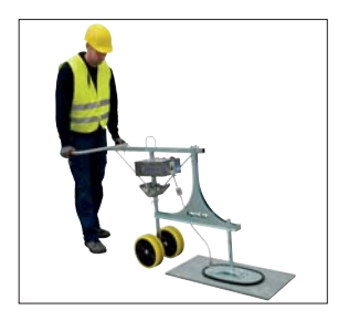
VPH-GREENLINE with VPH-RS