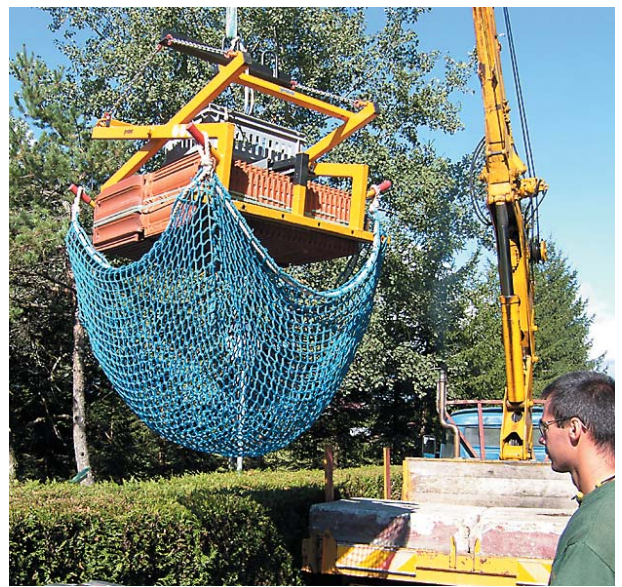
Roofing Element Clamp DEZ-UNI