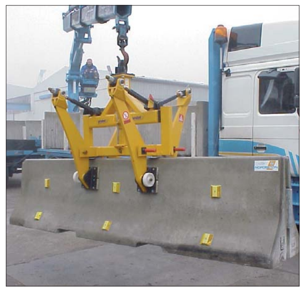
Concrete Highway Divider Clamp BSZ-KH-6.0