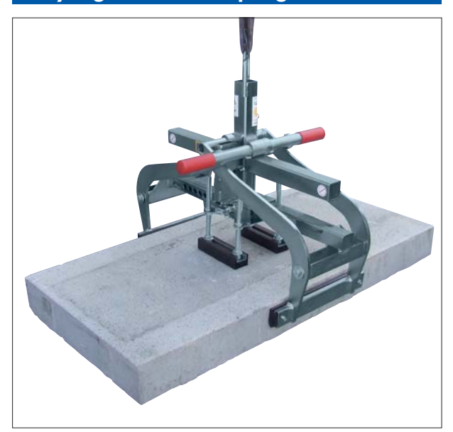
Concrete Step Handles TSZ-UNI with HVA-FTZ/TSZ