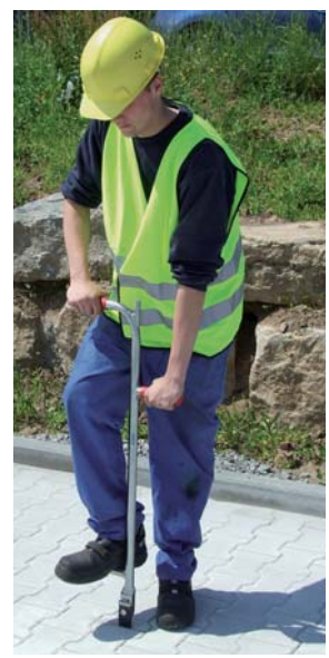
Alignment Bar RE