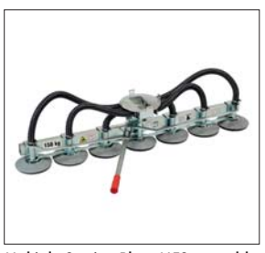
Multiple Suction Plate MFS, movable, for vacuum hose lifters