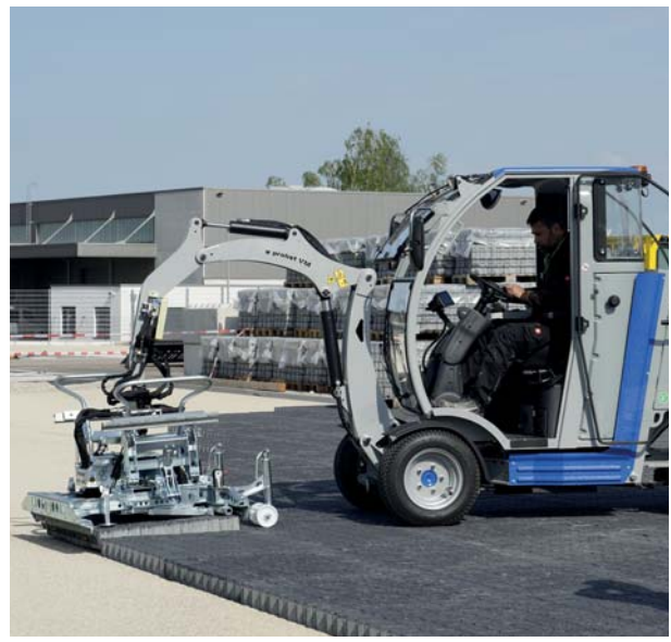
VM-X-PAVERMAX premium Paver Installation Machine with HVZ-UNI-II