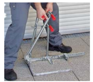
Slab Extractor PZ