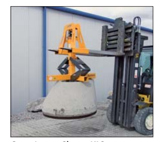
Cone Insert Clamp KIG