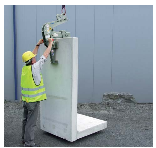
Grab for Angular Concrete Products WEZ-2