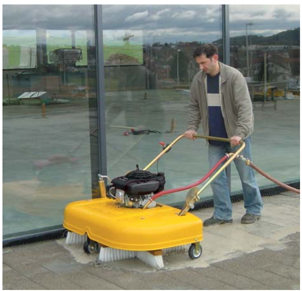
EASYFILL EF-H Paver Jointing Device