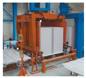
Cube Clamp STAZ with Three