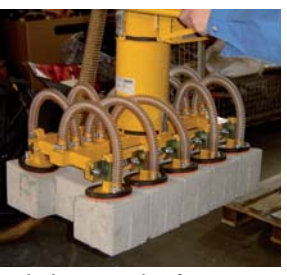
Multiple suction plate for gutter blocks