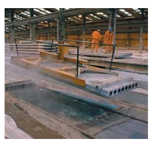
Laying Clamp for Hollow Core Slabs VZ-D