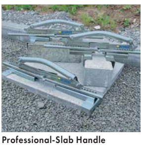
Professional-Slab Handle Systems PPH