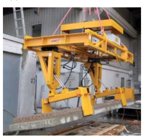
Setting-up device for noise protection walls