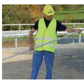
Screeding Rail Kit AZL-EP