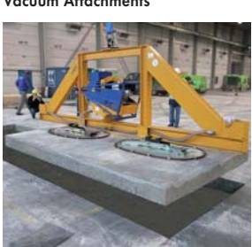
Vacuum Spreader Bar VT