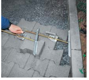
Measuring and Marking Tool MAL