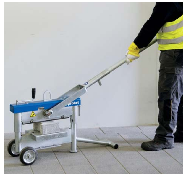
STONE SPLITTER STS-43-EASY