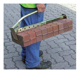
Brick Handle KKT