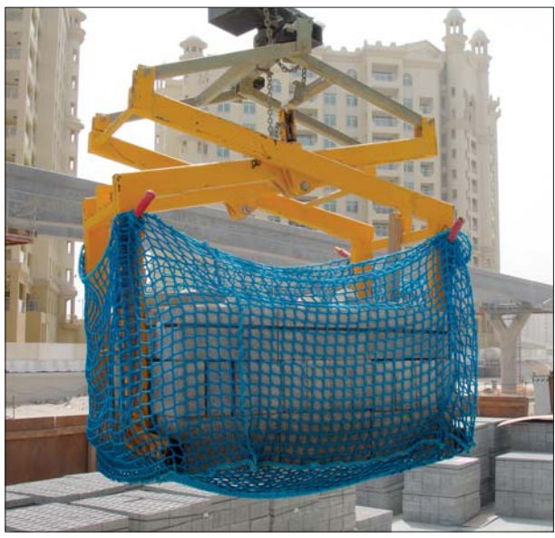
Scissor Grab SG