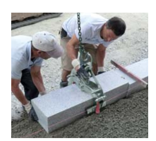
EASYGRIP EXG Border Stone Handle