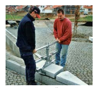
Concrete Step Handles TSV