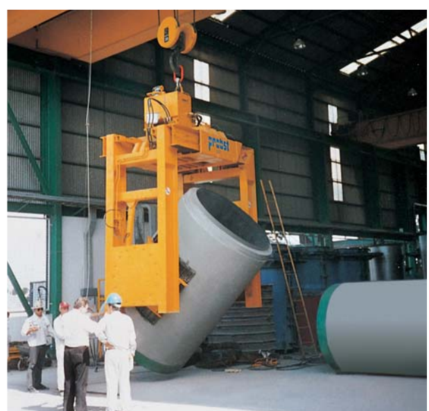
Gantry Crane Rotating Clamp for Pipes PWG-R