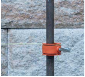
STRING ALONG SA