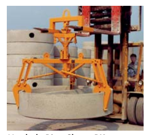
Manhole Ring Clamp RK