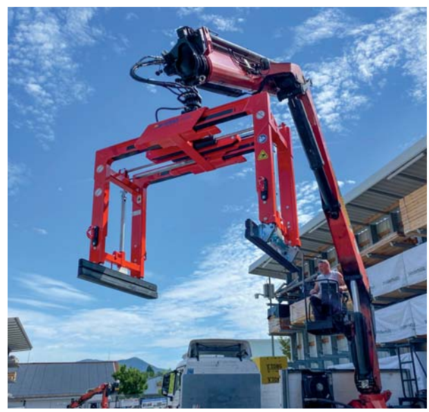
Block Loading Grab AKZ-UNI-H