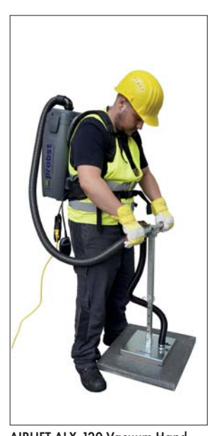
AIRLIFT ALX-120 Vacuum Hand Laying Device