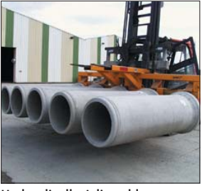
Hydraulically Adjustable Multiple Forks MFD-UNI