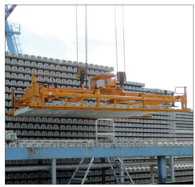
Concrete sleeper grab