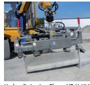
Hydraulic Laying Clamp VZ-H-UNI