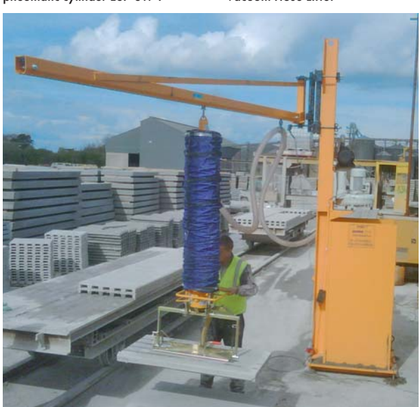
Vacuum Hose Lifter with Jumbo Travelling Crane JWK