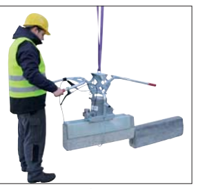
SPEEDY VS-140/200 Vacuum Hand Laying Device