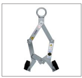
Cable Channel Clamp KKV-20/30