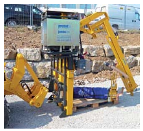
JUMBO-BV-VARIO in Transportation Position