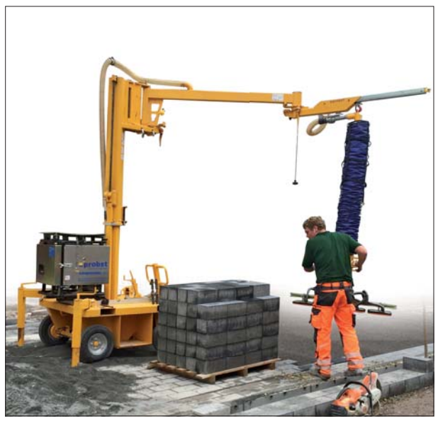
JUMBOMOBIL JM-VARIO Vacuum Slab Laying Machine