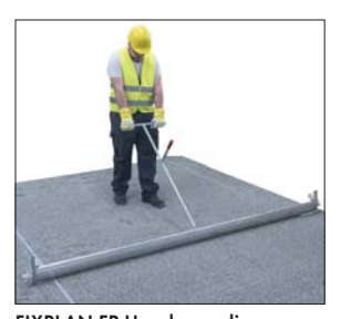
FIXPLAN FP Handscreeding System