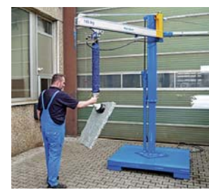
VACUSPEED VXS Vacuum Hose Lifter