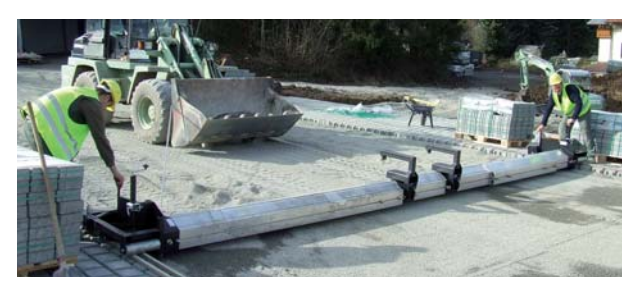
Telescopic Screeding Bucket TAK