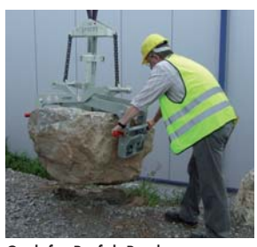
Grab for Prefab Products FTZ-MULTI-15/SQ