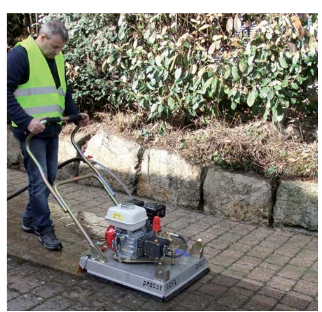
EASYCLEAN EC-60 Paver Cleaning Device