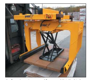
Selective Layer Clamp STAZ-SLC