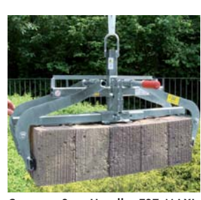
Concrete Step Handles TSZ-MAXI