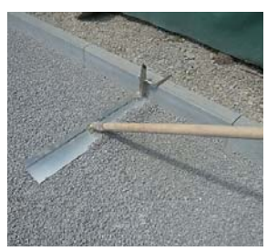
MINIPLAN MP-70 Sliding Finisher with HV