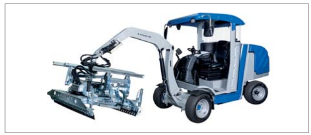
VM-X-PAVERMAX standard Paver Installation Machine with HVZ-UNI-II