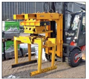
STAZ with KA and sideshift