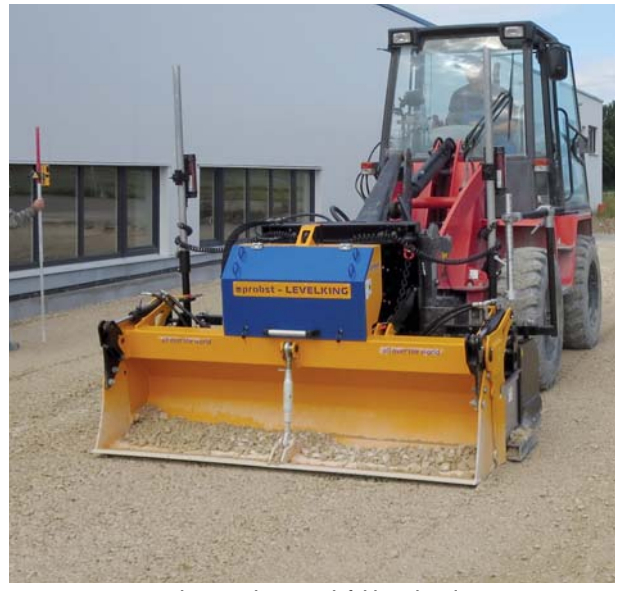
LEVELKING LK Screeding attachment with folding shovel KS