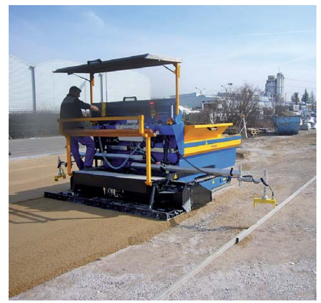
POWERPLAN PP Screeding Machine