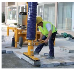
JUMBOMOBIL JM-VARIO Vacuum Slab Laying Machine