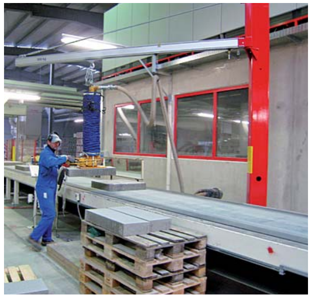
Aluminium Pillar Swing Crane AWSK