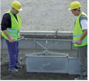
Laying Clamp VZ-I