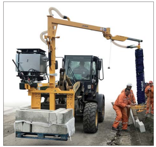
JUMBO-BV-VARIO Vacuum Kerb Stone Installation