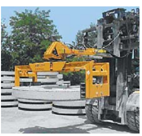
Fork Lift Grab STAZ for Cover