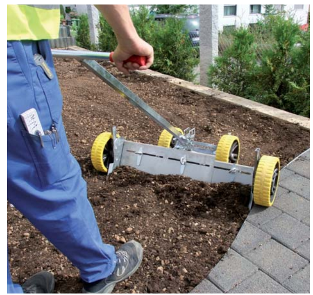
LEVELFIX LF-75/125 Manual Screeding System