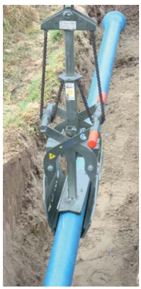
Round Grab RG-8/40