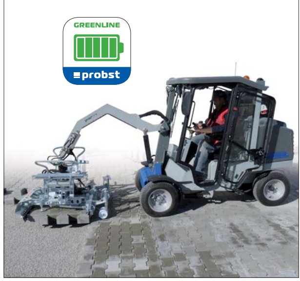
Paver Installation Machine VM-301-GREENLINE with HVZ-UNI-II