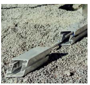
Screeding Rails AZL