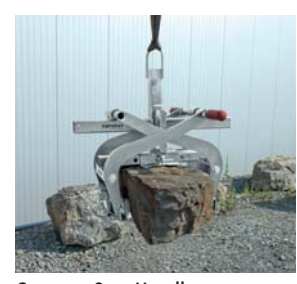
Concrete Step Handles TSZ-UNI-WB-SQ