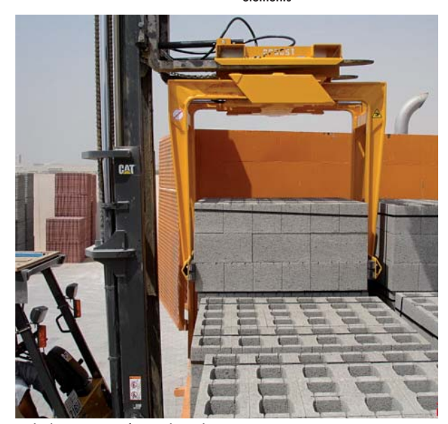
Fork Sleeves ET-E-4 for single grabs