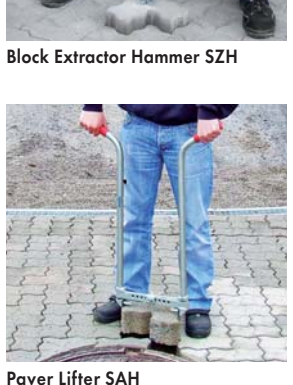
Paver Lifter SAH