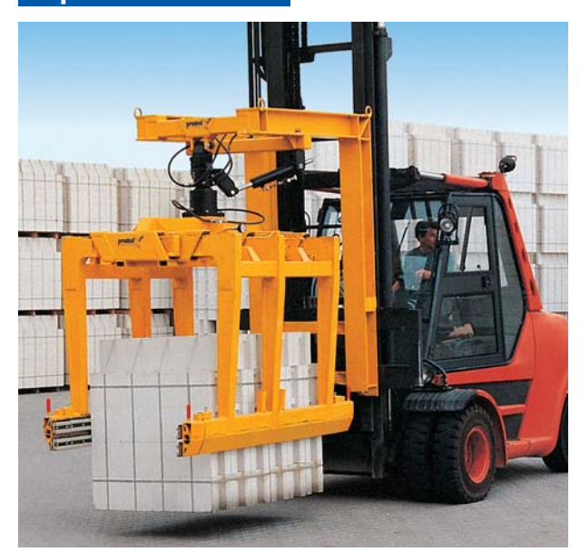
Fork Lift Attachment STAZ-KS